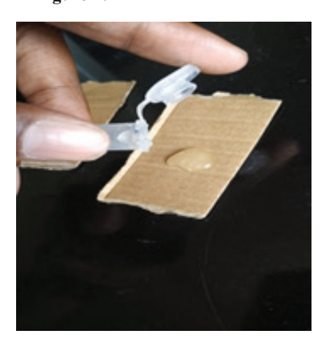
Figure 8: Applying Glue on Card Board

Acidic pH was maintained by the incorporation of 1N NaOH. Different volume of sample was obtained after 2 hrs & and reaction was arrested by heating 90°c for 10 mins sample centrifuged at 12,000 rpm for 15 mins. Supernatant collected freeze dried & stored at -20°c for subsequent analysis.