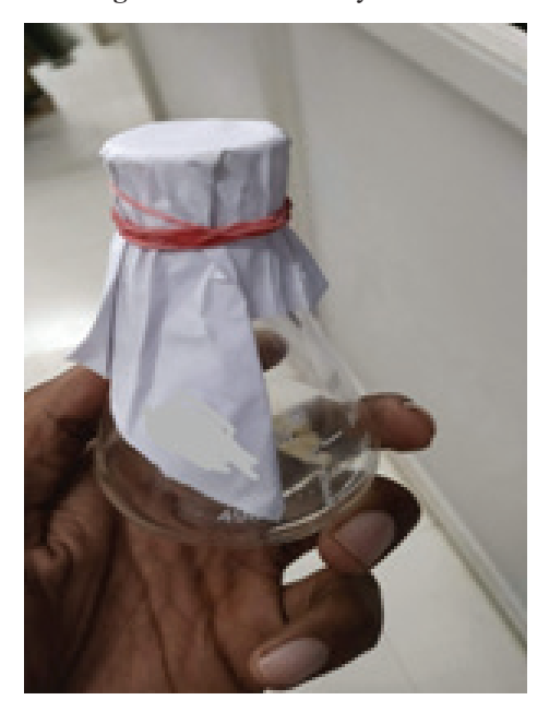
Figure 4: Casein Before Centrifugation