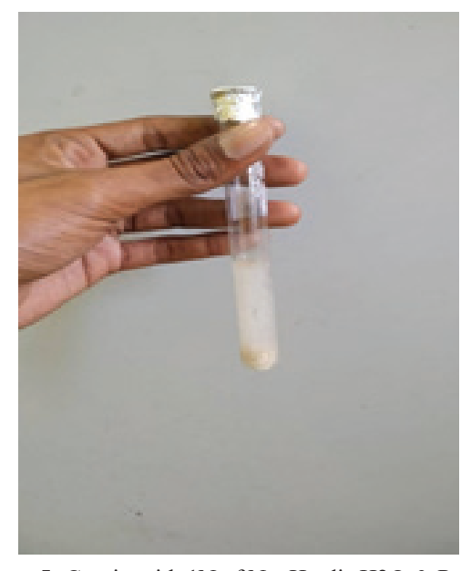
Figure 5: Casein with 1N of NaoH, dis H2O & Papain