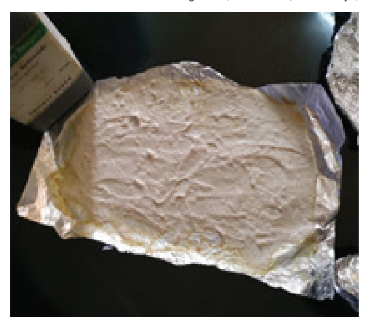
Figure 3: Casein of Soya Milk