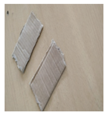
Figure 7: Two Card Board Pieces