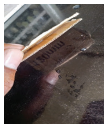
Figure 9: Two card Boards were stacked using Glue shows three different dried casein preparations from various types of milk

The casein thus prepared was centrifuged and dissolved for the preparation of glue which is shown in Figure -4,5