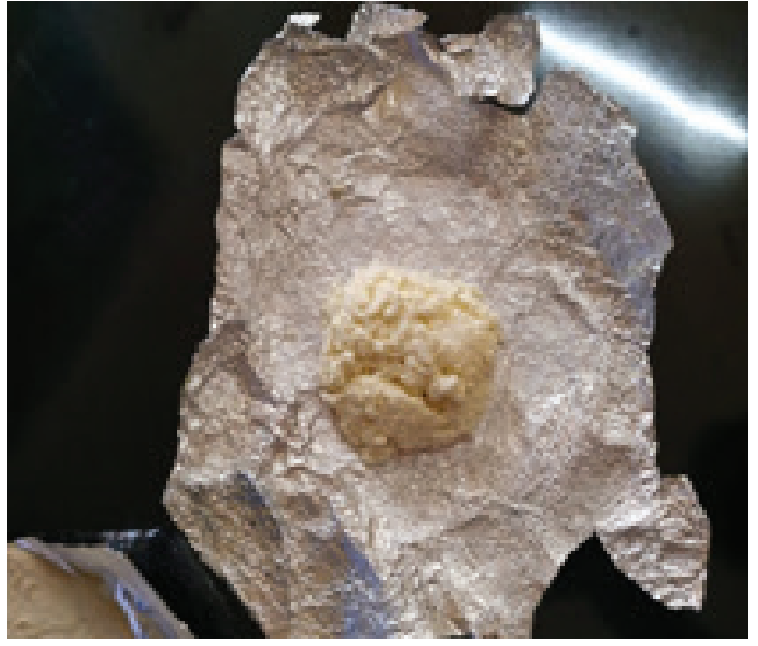
Figure2: Casein of Pastured Milk