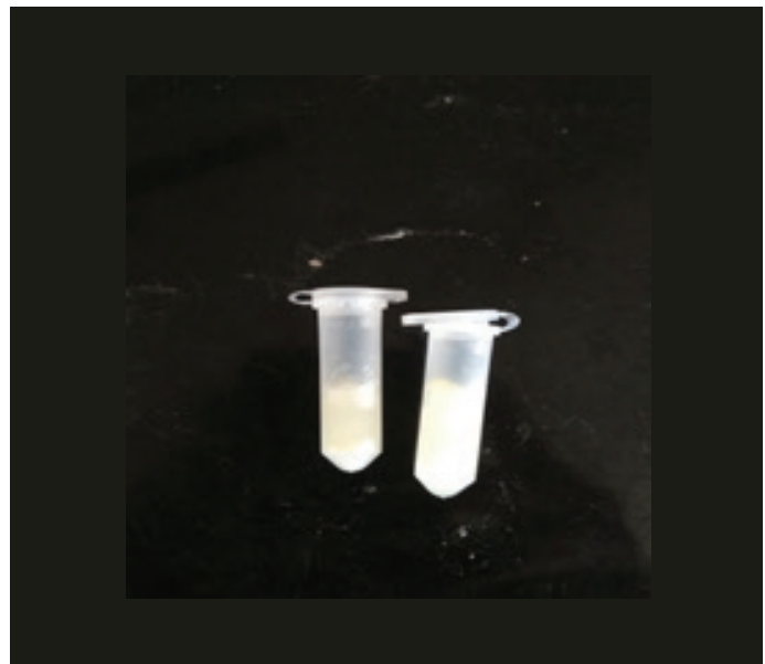
Figure 6: Water Resistant Glue in eppendorf