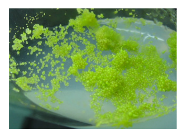
Figure 1. seed germination of Arundina graminifolia