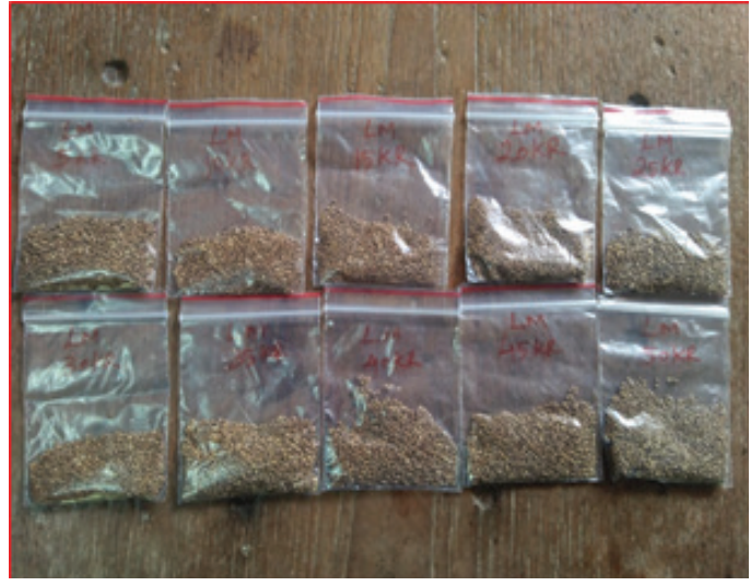
Figure 1. Gamma chamber and little millet seeds