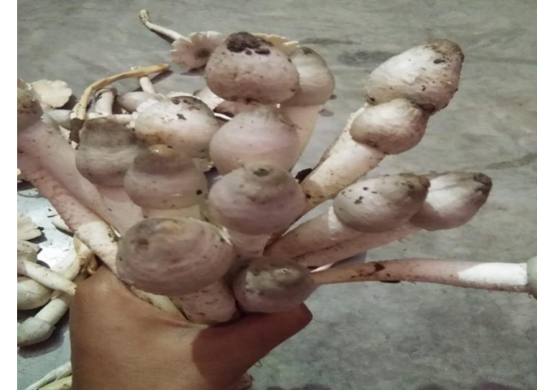
Termitomyces albuminosaTermitomyces spp. (big size)Fig. 3: Wild edible mushrooms collected and consume in Bastar Region of Chhattisgarh