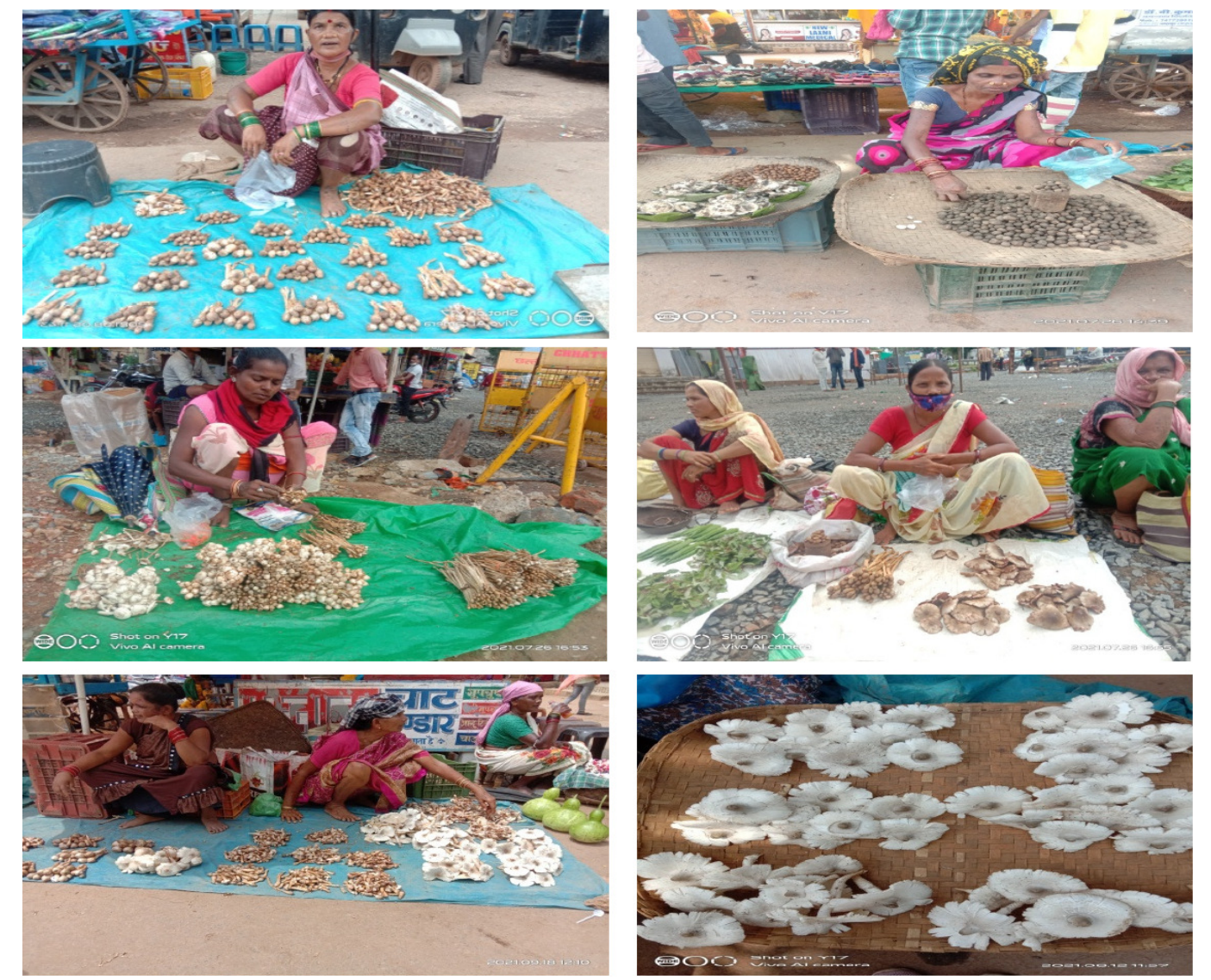
Fig. 4: Mushroom collected from Sal forest and sale in local markets at Bastar, Chhattisgarh

Mushroom picking for food with the onset of monsoon showers have been customary in Bastar amongst the different communities. In recent times, mushroom growing is becoming popular because it adds to the income of especially those growers having no or insufficient land. Mushroom can directly improve livelihoods through economic, nutritional and medicinal contributions. Various reasons have been cited for this neglect, several studies have been conducted on Mushroom collection and cultivation for rural livelihood and it's challenges of collection and cultivation India. Market price of Mushrooms in Jagdalpur is 500 - 600/kg. Thus, in light of vast potentiality of boda and other mushrooms as a rich source of protein and essential nutrients for dietary source among local tribal inhabitants of Bastar. Villagers collect mushrooms from their forests and sale them at low prices to Kochia within or outside the city due to lack of facilities to go to big cities for their living. He sales Kochia at a higher price. If someone else who buys it in bulk at a higher price, which is from big cities sales it at a higher price. Which he sales in the public market of big cities at the highest price.