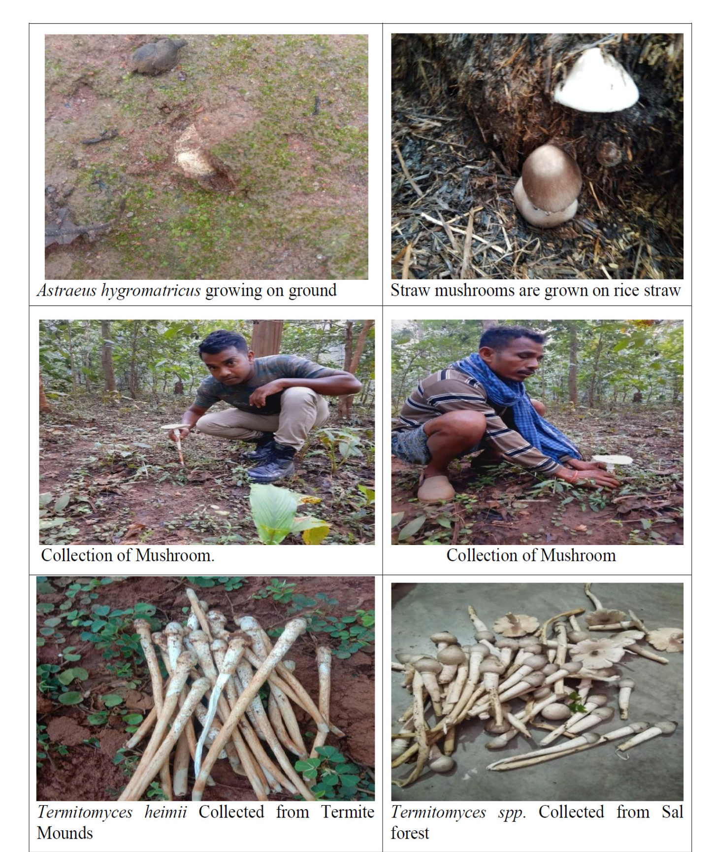
Fig. 1: Different types Mushrooms found in Bastar Region of Chhattisgarh State